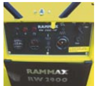
Clearly arranged cockpit