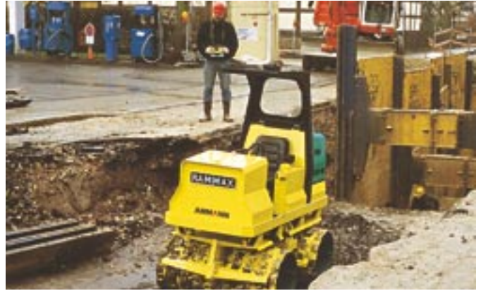
RW 2000: Effective compaction and high surface area output