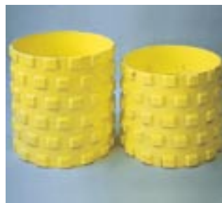
Different drum widths and profiles