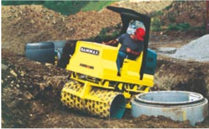
RW 2900: The world's most powerful trench roller