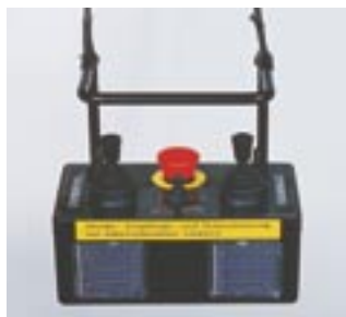
Infrarot-solar remote control